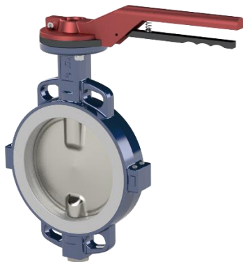
Butterfly Valve BVTT

TA-Luft 2002/VDI2440 FE ISO 158848-1 Class BH Bureau Veritas DNV Type Approval