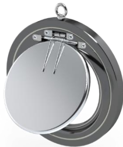
Swing Check Valve GS